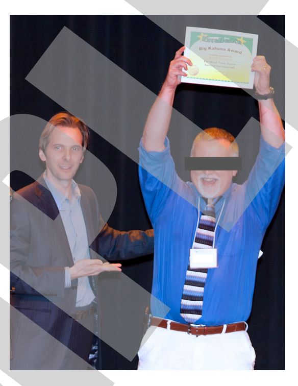
Give awards to your audience members that have the best sense of humor.

A committee also protects you from shouldering all of the responsibility should something go wrong. If something falls flat, you have the comfort of knowing you ran it past your committee.