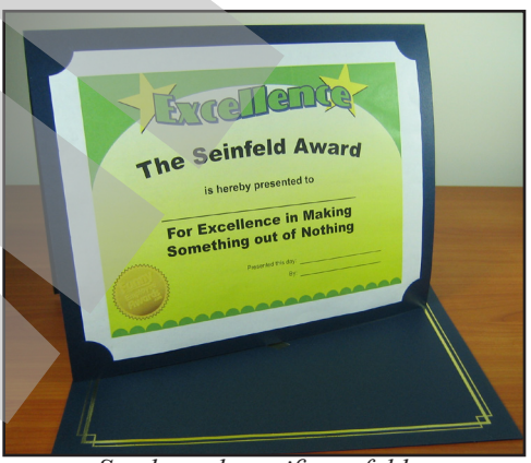
Southworth certificate folder

To take it up another notch, use a certificate frame (similar to a picture frame — and some picture frames will work nicely). You can also purchase plaques that allow you to slide the certificate right in. These methods will ensure your certificates will continue to bring laughs for years to come.