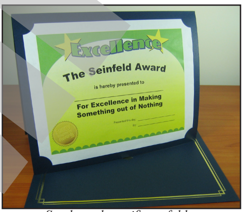
Southworth certificate folder

To take it up another notch, use a certificate frame (similar to a picture frame — and some picture frames will work nicely). You can also purchase plaques that allow you to slide the certificate right in. These methods will ensure your certificates will continue to bring laughs for years to come.