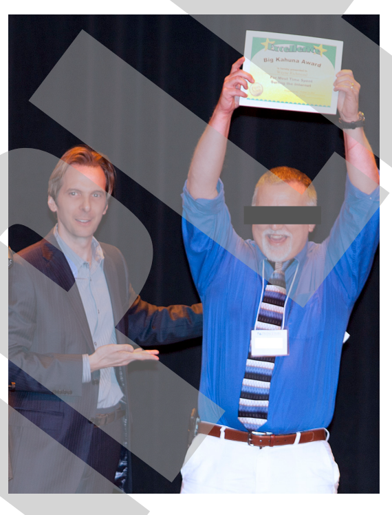
Give awards to your audience members that have the best sense of humor.

A committee also protects you from shouldering all of the responsibility should something go wrong. If something falls flat, you have the comfort of knowing you ran it past your committee.