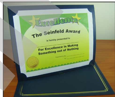
Southworth certificate folder

To take it up another notch, use a certificate frame (similar to a picture frame — and some picture frames will work nicely). You can also purchase plaques that allow you to slide the certificate right in. These methods will ensure your certificates will continue to bring laughs for years to come.