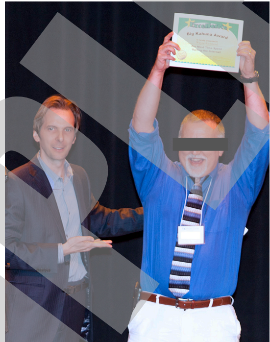
Give awards to your audience members that have the best sense of humor.

One method that works well is to make a list of everyone you'd like to give awards to, and then find an award that's suitable from the list of options.